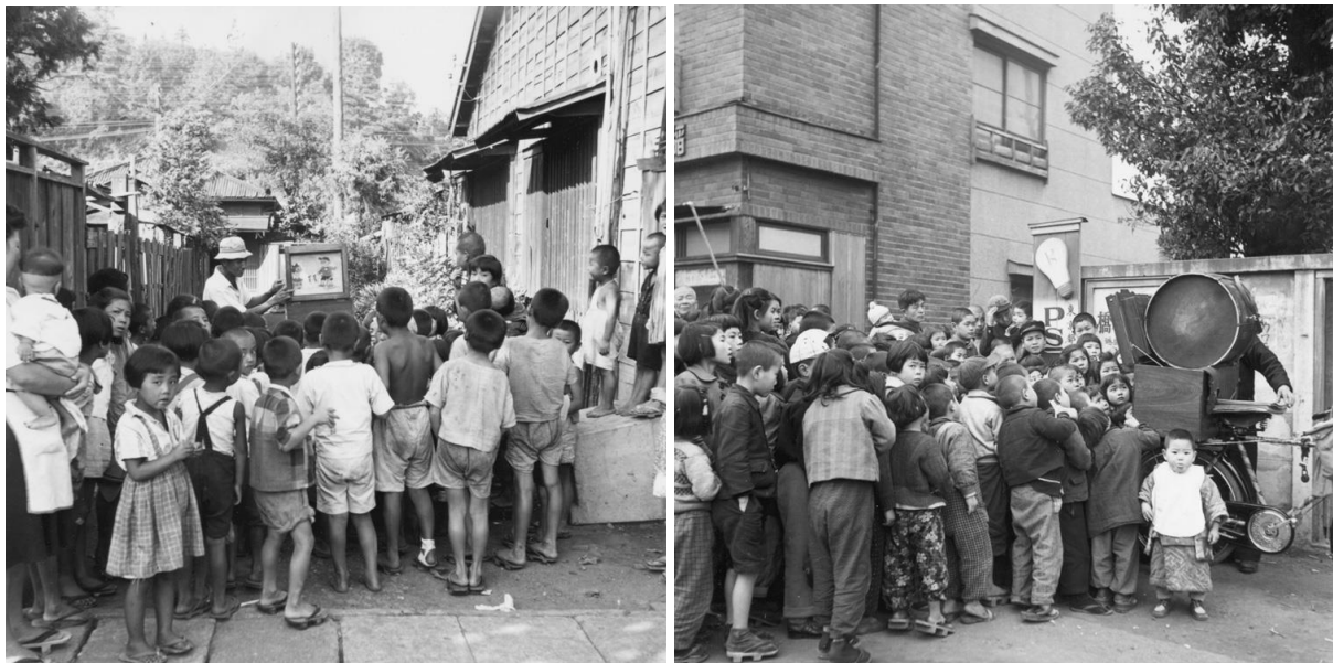
Fig. 1. Street Corner Kamishibai performance, 1928. Orbaugh, 2014. p. 39.

The emaki (picture scroll) was used during the Heian period in Japan in the 11 th and 12 th centuries. It is thought to be the predecessor of the kamishibai and comprised a horizontal paper scroll that was rolled over a viewing screen ( Hirofumi ). This narrative form was most prominently used to depict the 11 th century novel, Genji Monogatari ( Motoyama ). However, this art form gradually became neglected over the years, and was almost completely lost, until its reappearance in the early 20 th century.