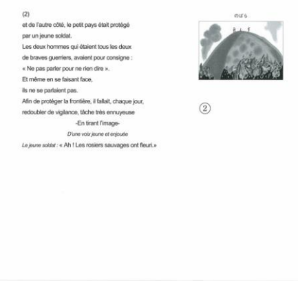
Fig. 5, 6, 7 & 8. Les roses sauvages , 2009. Original work by Mimei Ogawa / Text by Seishi Horio / Illustrations by Makoto Sakurai. Available from: http://www.doshinsha.co.jp/kamishibai/translations/form.php [Accessed: 05/10/16]

Later, Japan experienced a resurgence of interest in national art, traditions and kamishibai storytelling. Teachers and cultural centers started to raise awareness among the public, and libraries compiled material about this Japanese art form. These actions eventually led to the spread of kamishibai to the United States in the 1990s. The company Accursed Toys created a digital adaptation of the kamishibai model for Microsoft, which enabled users not only to view the images and stories, but also to add music and sound effects at the same time.