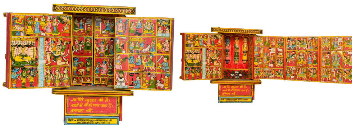
Fig. 14. Kaavad . A portable shrine.

The Kaavad is a form of storytelling that goes back hundreds of years. The panels were purposefully crafted and illustrated to form a device that, just like the kamishibai , was used to tell stories. In addition to being a traditional form of oral storytelling, a donation could be left in a draw positioned in the base of the Kaavad .