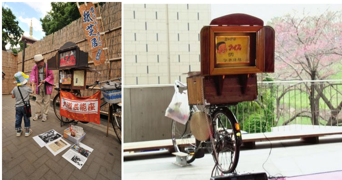
Fig. 9. Kamishibai in Asakusa