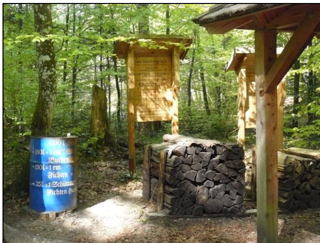
Figure 2. 'From wood to timber' station (Bergwald-Erlebnis-Pfad „Inzell“)