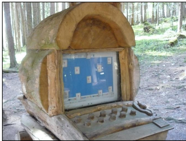
Figure 1. Forest computer in the 'research station' (1. Österreichischer Natur-und Umwelterlebnispfad)

Many of the assessed nature experience trails can be considered as exemplary good practice, but from an environmental pedagogical point of view, the Austrian „1. Österreichischer Natur-und Umwelterlebnispfad”, and the German Bergwald-Erlebnis-Pfad „Inzell” nature experience trails can be highlighted as examples to be followed ( Figures 1 and 2 show stops of the nature experience trails ).